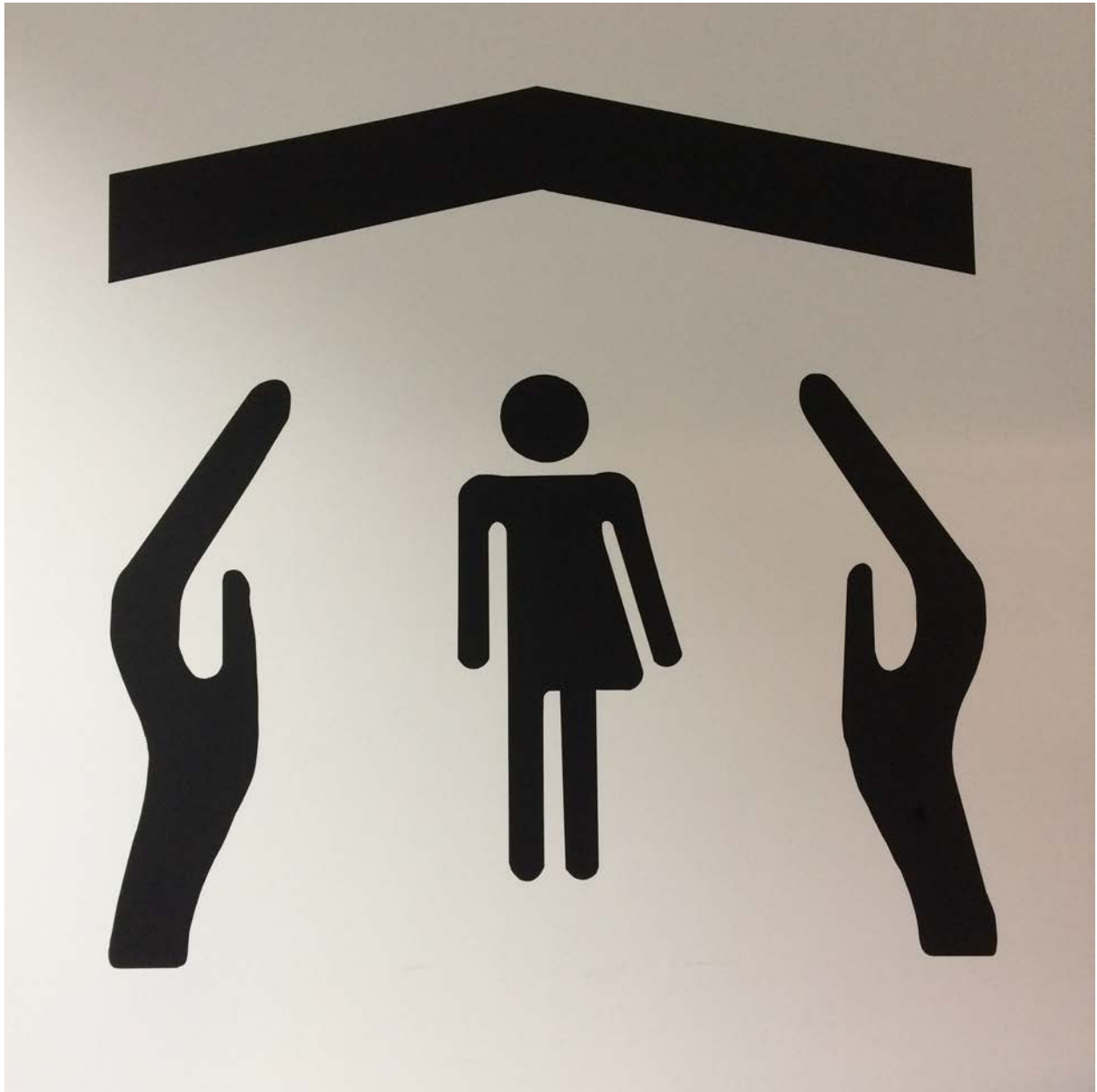
Mural of queer care sign inside the gallery.

Gossip Free Zone is a site specific work that critically looks at the environmental zone through the focus on mental well-being. On four entrance roads to the environmental zone in Rotterdam traffic signs were placed, pointing towards the Gossip Free Zone. In the gallery 'De Garage' we produced two murals and a text on the window that read: Refuse to gossip. Create positive social bonds. Take care of each other.