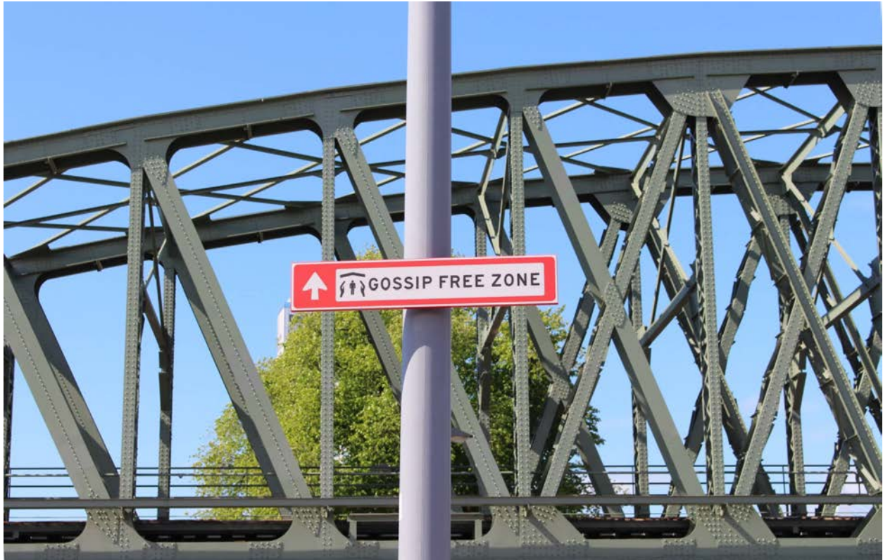
Traffic sign on the entrance road to the environmental zone.