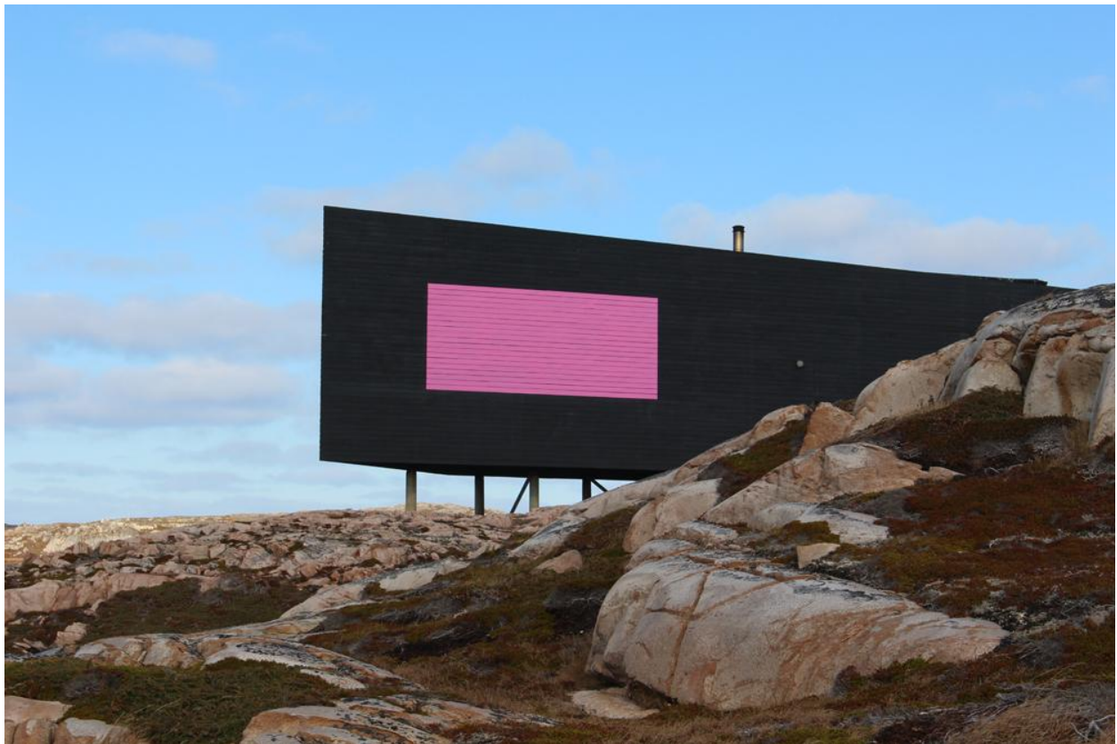
The Pink Gaze, mural on the exterior wall, 6 x 3m.

In our political attitude, that has its roots in collective thinking, we insist on making an art statement on the outside. The outside is something that concerns and can be discussed by everybody. Reacting to this architecture forces us to think about architecture itself.