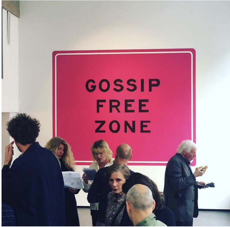
Mural of imaginary street sign inside the gallery.